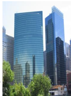
333 W. Wacker

rejected the simple design of the International style. Borrows ideas from older styles like the Greek and Roman architecture and interprets them in a new and modern way. Glass curtain walls became popular with Post-Modernism.